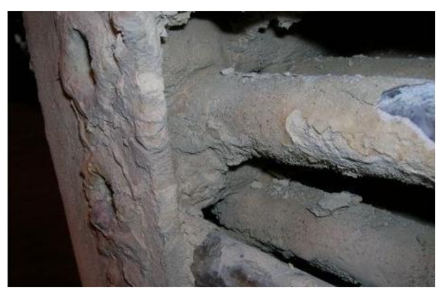
External Scale Formation

The terms "Hard Water" and "Soft Water" typically refer to the amount of calcium and magnesium found in the water. Hard water is high in calcium and/or magnesium while soft water is low in these minerals. The image below shows severe scale formation on heat transfer coils in the form of calcium carbonate.