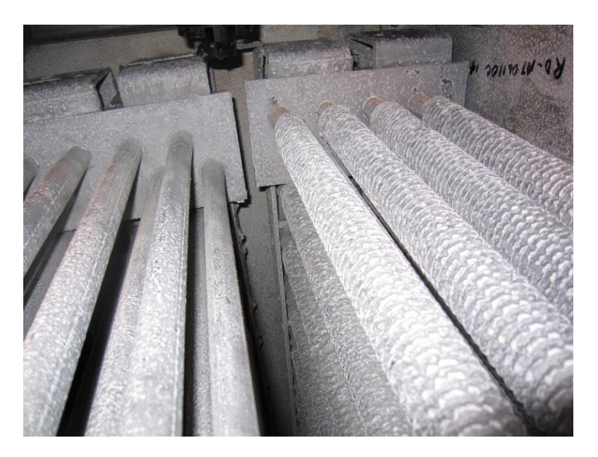
Commencement of Scale Formation on Both Coils

• To facilitate scale build up on the coils of the closed circuit cooler, the bleed rate was reduced and the cycles of concentration were allowed to increase dramatically. The final water chemistry reading was 8.49 pH with a conductivity reading of 20,770 \mu S. See Addendum A for the results of several water chemistry samples taken during the test.