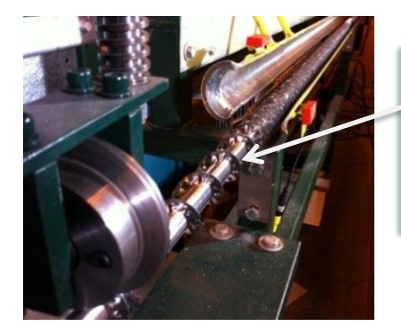
EVAPCO's Finning Line Precisely and Efficiently Applies the Fin Material to the Thermal-Pak™ tube.