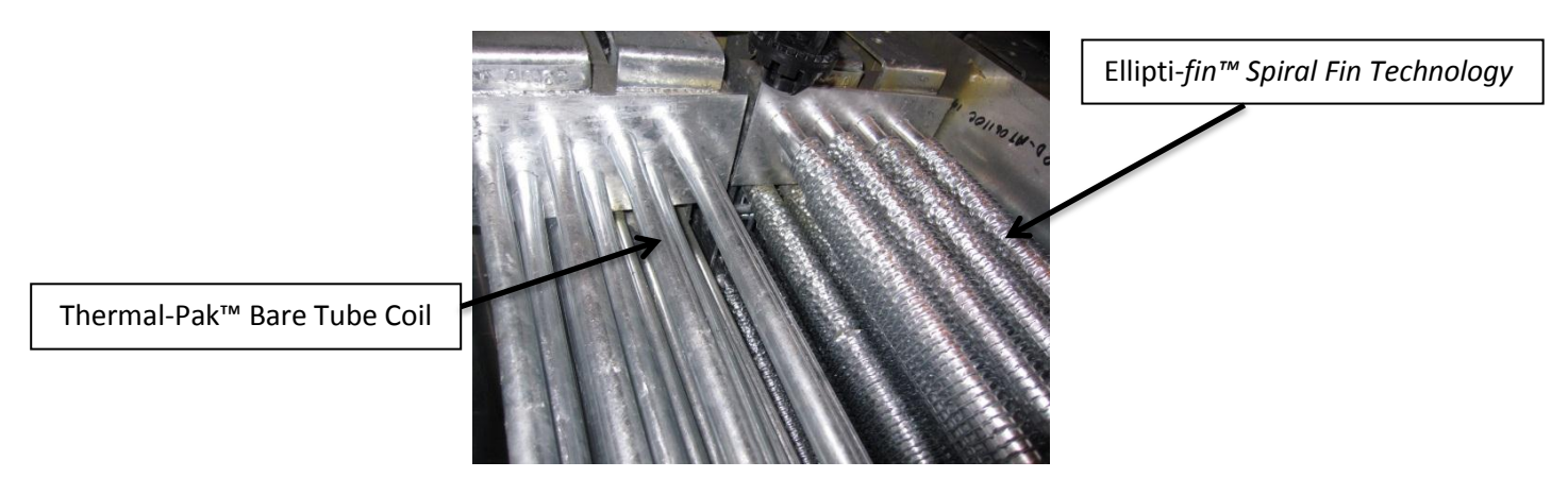
Two (2) Coil Design Prior to Commencement of Scale Formation Test

• To facilitate scale build up on the coils of the closed circuit cooler, the bleed rate was reduced and the cycles of concentration were allowed to increase dramatically. The final water chemistry reading was 8.49 pH with a conductivity reading of 20,770 \mu S. See Addendum A for the results of several water chemistry samples taken during the test.