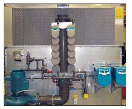
Closed Circuit Cooler Bruges, Belgium