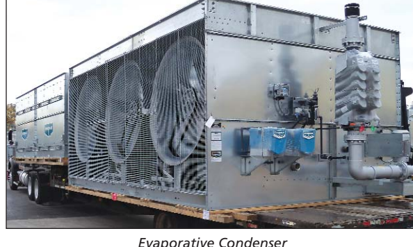
Evaporative Condenser Birmingham, AL USA