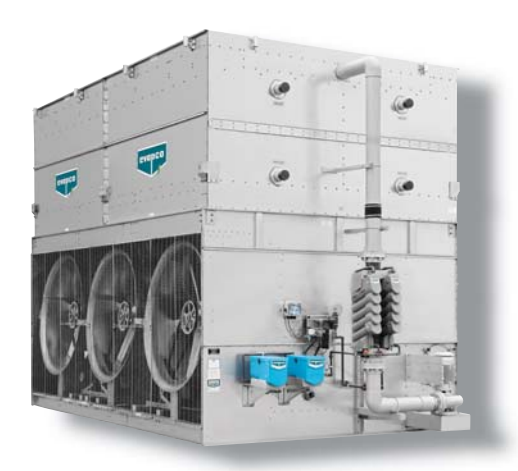
EVAPCO's Innovative Eco-PMC Evaporative Condenser