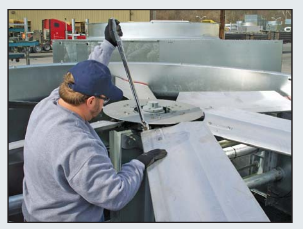
Factory Trained and Certified Mechanics