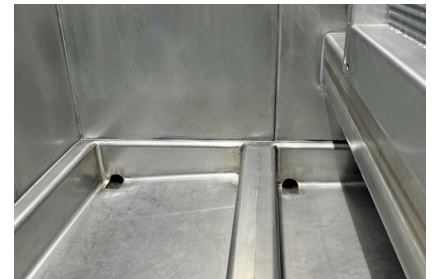
Fully Welded Drain Pan

The unit incorporates fully welded and pitched stainless steel drain pan systems. The welds are smooth and non-porous. The drain connections are fully recessed to facilitate complete drainage in all sections.