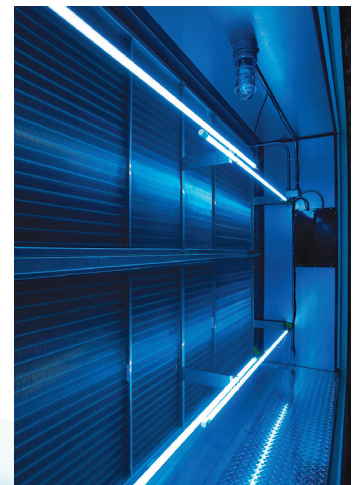
ESS UVC Light System

Heating and cooling coils are maintained in clean and contaminant free condition with the optional exclusive EVAPCO Sanitizing System (ESS). The ESS uses the latest high output UVC emitter technology to effectively eradicate mold and other contaminants right at the source. Properly installed and maintained ESS UVC lights will eliminate the need for coil sanitizing or cleaning. However, should coil cleaning be required, it can be safely performed without removing the UVC lights which are 100% watertight.