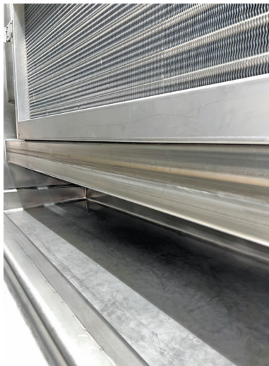
Ultra-CPA System – Cleaning Under the Coil is Easy and Efficient

Uniquely designed coil support system that makes cleaning under the coil both easy and efficient. There are no longer "open" structural steel supports under the coil which obstruct the cleaning and inspection process. The new "closed" coil support system eliminates "hidden" areas, while providing full visibility and access to the coil supports and surrounding areas for maximum cleaning efficiency.