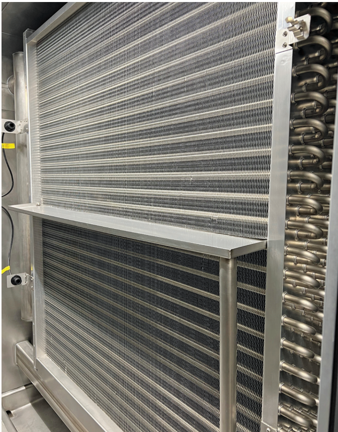
Stainless Steel Tube, Aluminum Fin Evaporator Coil