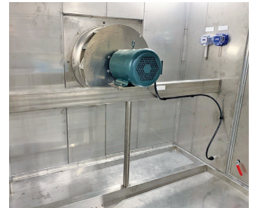
Direct Drive Blower

The use of Variable Frequency Drives will result in efficient fan operation, precision balancing of the system and maximum energy savings. In addition, The a "closed" structural support system completely eliminates the traditional support and framing around and under the blower, making cleaning and inspection simple and efficient.